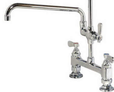
PR30 STANDARD PRE RINSE/WASH OVERSPRAY WITH SWIVEL DRAW OFF TAP