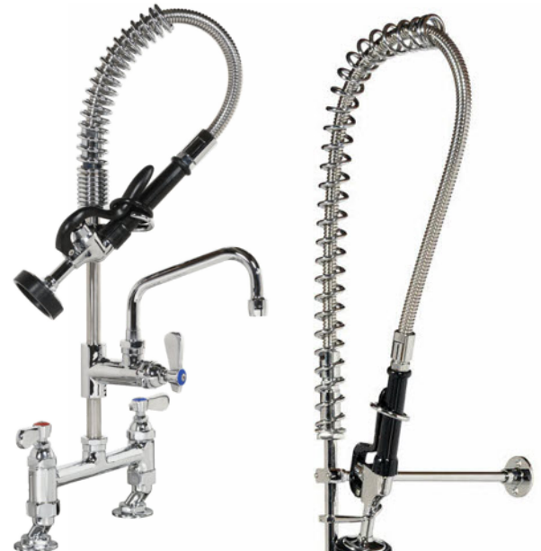
PR20 COMPACT PRE RINSE/WASH OVERSPRAY WITH SWIVEL DRAW OFF TAP

All Pre Rinse Wash units are dispatched in easy to handle and store cartons ready for on site assembly