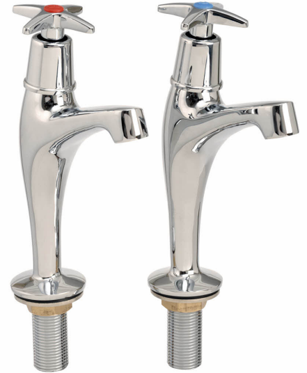
SPTC 1/2" PILLAR TAP CROSS HEAD

All pillar taps are dispatched in easy to handle and store cartons ready for on site installation.