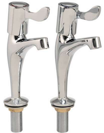
SPTL 1/2" PILLAR TAP LEVER HANDLE