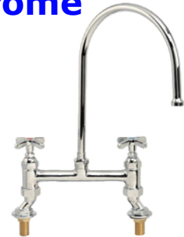
MXDC 1/2" MIXER CROSS HEAD TAPS GN9 SWIVEL SPOUT ADJUSTABLE CENTERS

All mixer taps and swivel spouts are dispatched in easy to handle and store cartons ready for on site installation