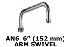
AN6 6" (152 mm) ARM SWIVEL