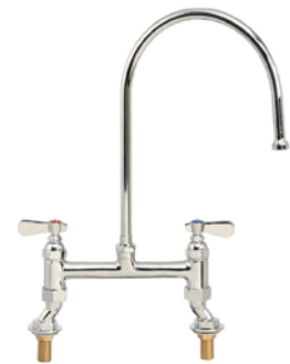
MXDL 1/2" MIXER LEVER TAPS GN9 SWIVEL SPOUT ADJUSTABLE CENTERS