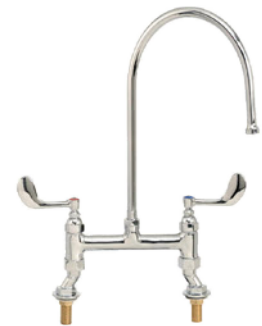
MXDW 1/2" MIXER ELBOW TAPS GN9 SWIVEL SPOUT ADJUSTABLE CENTERS